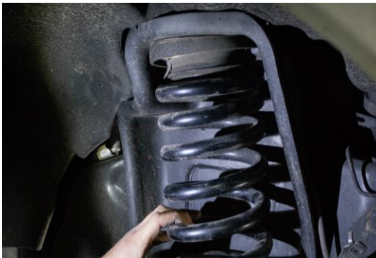
Figure 9A: Vehicle Lift Height