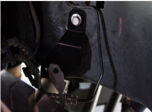
Figure 3: Passenger Brake Line Bracket