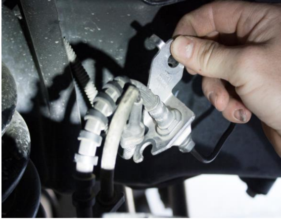
Figure 2A: Passenger ABS Line Removal