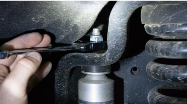
Figure 8A: Front Shock, Top Mount