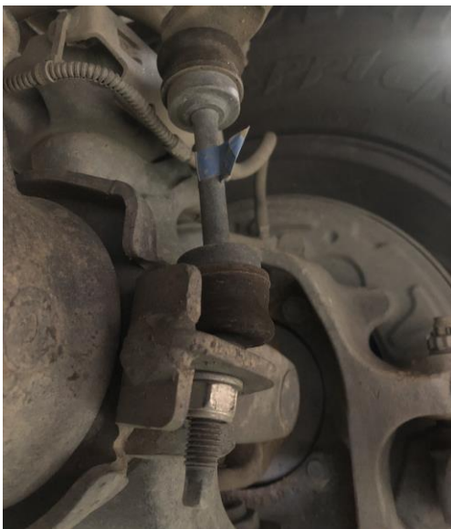
Figure 7A: OE Sway-Bar End Link