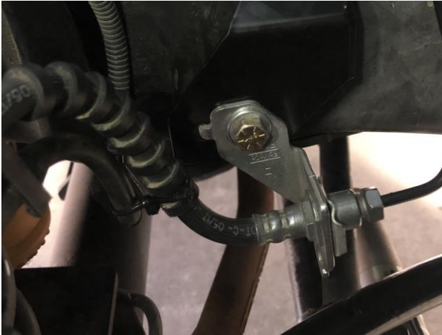
Figure 5: Diver Side ABS Line Installed