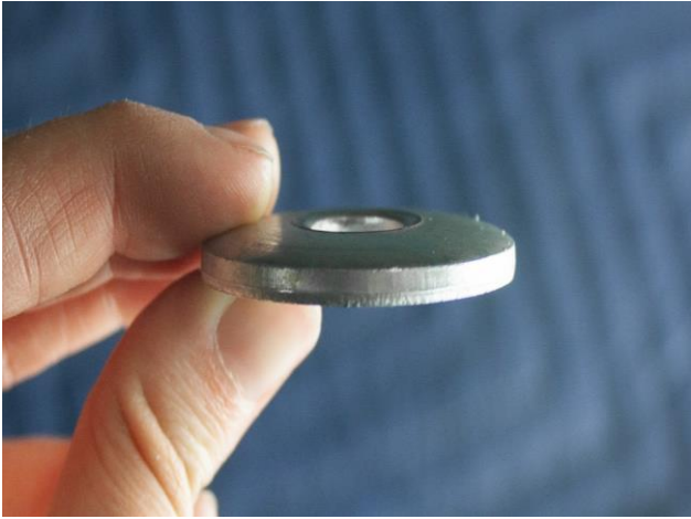
Figure 15A: Concave Shock Mounting Washer