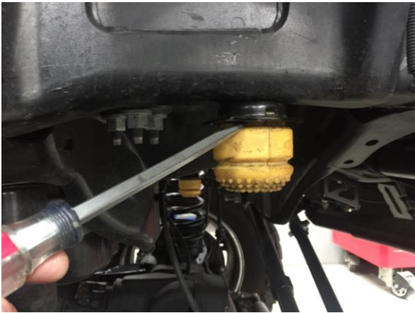
Figure 10A: OE Bump Stop Spacer