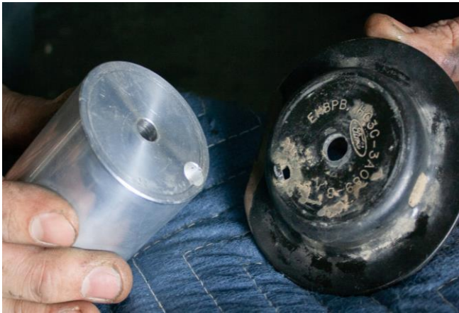
Figure 12: Bump Stop Spacer Alignment