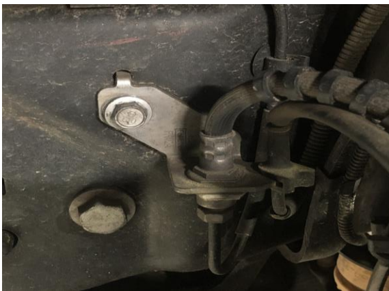
Figure 1A: OE Brake Line Bracket